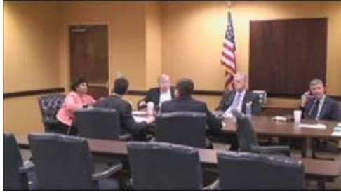
Cobb County Elections Board

The lawsuit argued they should have since they pay county taxes.